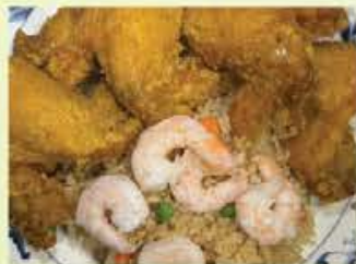
Chicken Wing w. Shrimp Fried Rice