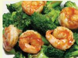
Shrimp w. Broccoli