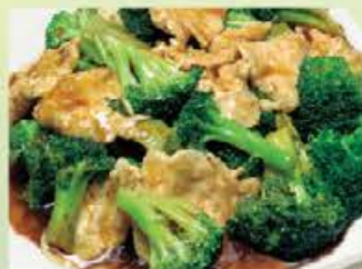
Chicken w. Broccoli