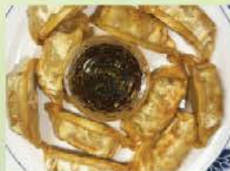
Steamed or Fried Dumplings (10)