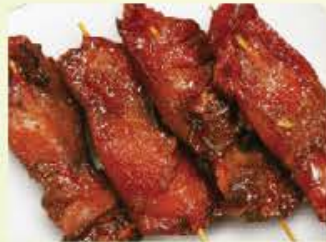
Teriyaki Chicken (4)