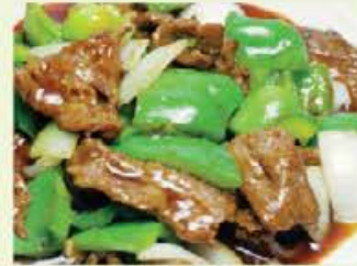
Pepper Steak w. Onion