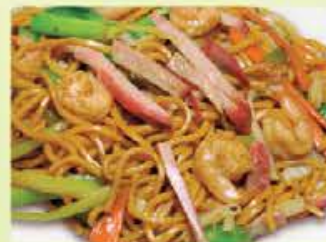
House Special Lo Mein