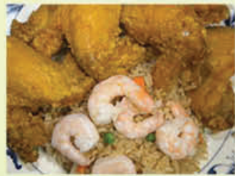
Chicken Wing w. Shrimp Fried Rice