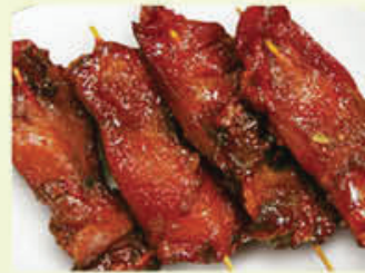
Teriyaki Chicken (4)