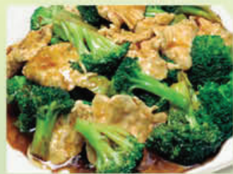
Chicken w. Broccoli