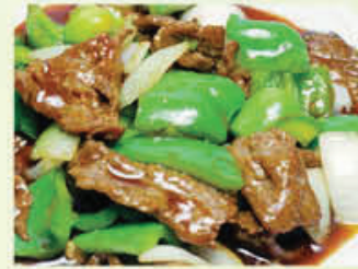
Pepper Steak w. Onion