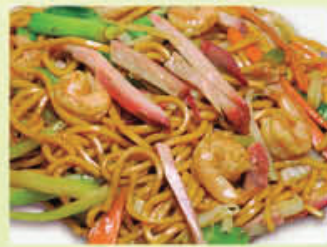
House Special Lo Mein