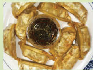
Steamed or Fried Dumplings (10)