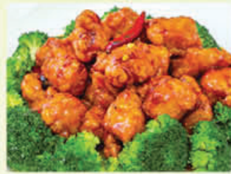
General Tso's Chicken