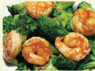
Shrimp w. Broccoli